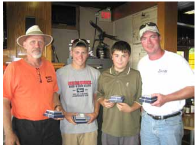
Friendship Team Runner-ups