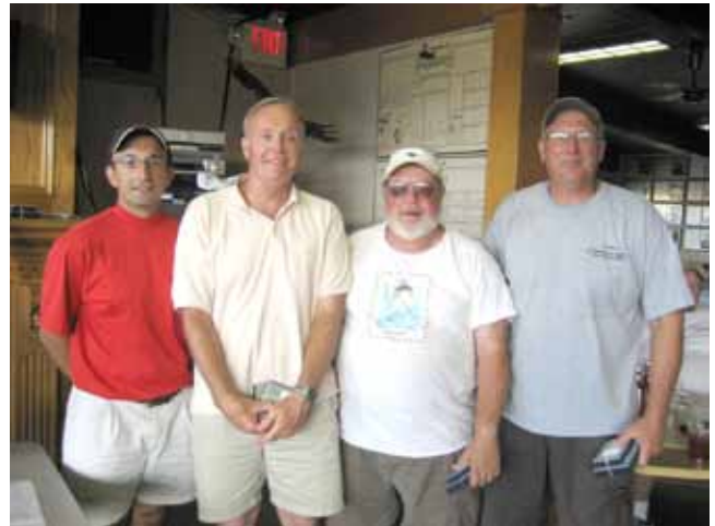
Friendship Team Runner-ups