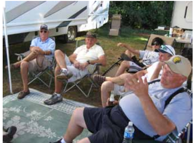
Life is Good!!