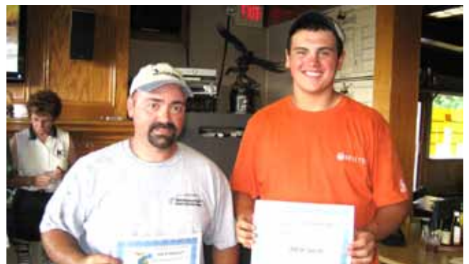
More First 100s.