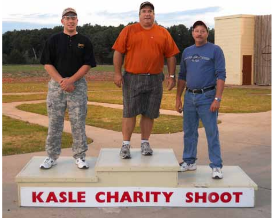
20 Gauge Winners