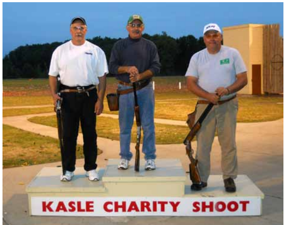
28 Gauge Winners