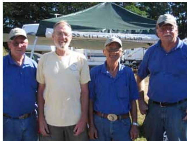
Cass City Boys