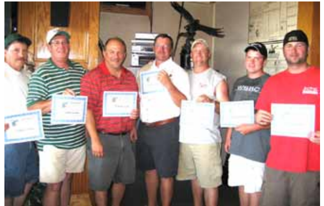
2010 STATE First 100s.