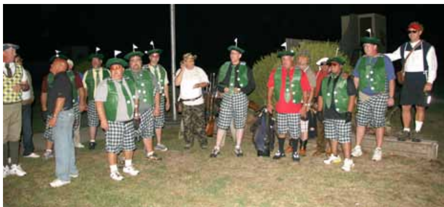
B-K Cup Finalists