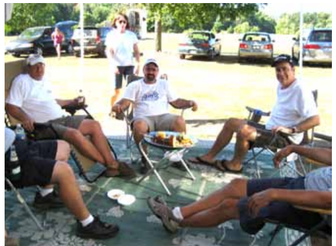
Especially if you shoot skeet!