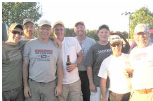
Look at all those "Yoopers."