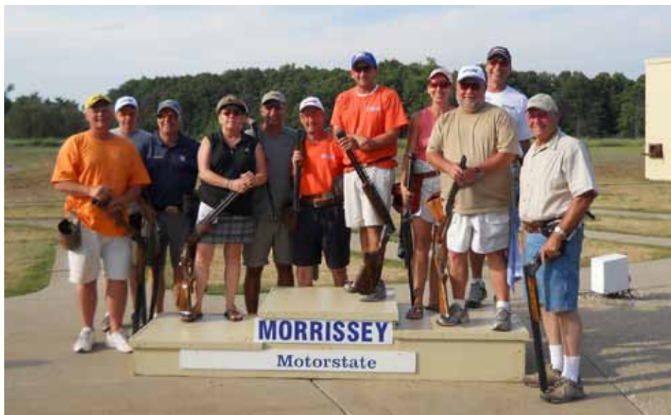
Motor State Kolar Challenge