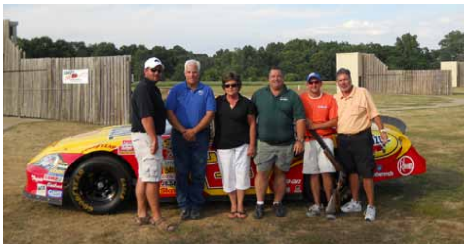
Motor State 28 Gauge