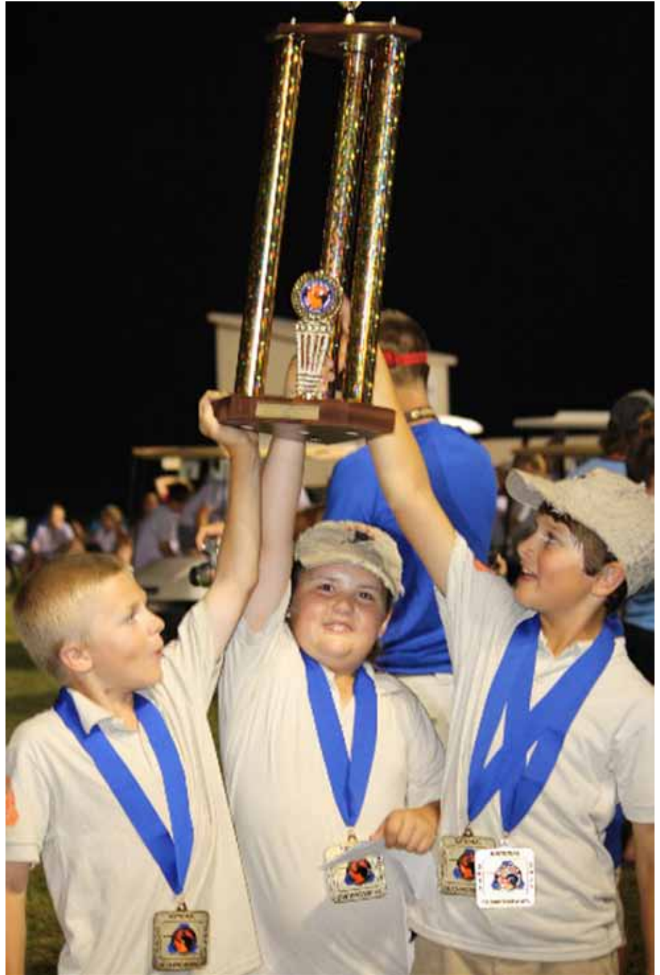
Rookies Squad from North Macomb take trophy at Nationals.

The National SCTP Event was held in Sparta this year on July 15th and 16th. Michigan was represented this year by teams from Flat River Conservation Club, Grand Blanc Huntsman's Club, Goodrich School District, North Macomb Sportsman's Club, St. Joe County Straight Shooters and Western Wayne County Conservation Association. In total, 6 Varsity Teams, 4 Junior Varsity Teams, 2 Intermediate Advanced Teams, 3 Intermediate Entry Teams and 2 Rookie Teams from Michigan attended this year's National Event.