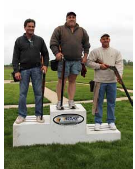
Kolar Mid-America 12-Gauge winners