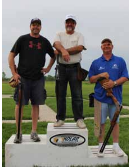
Kolar Mid-America 20-Gauge winners

We awoke Sunday to yet, another, beautiful day -- blue skies and temperatures rising to near 90. Unbelievably, there was no wind to speak of for the .410 event in the afternoon.