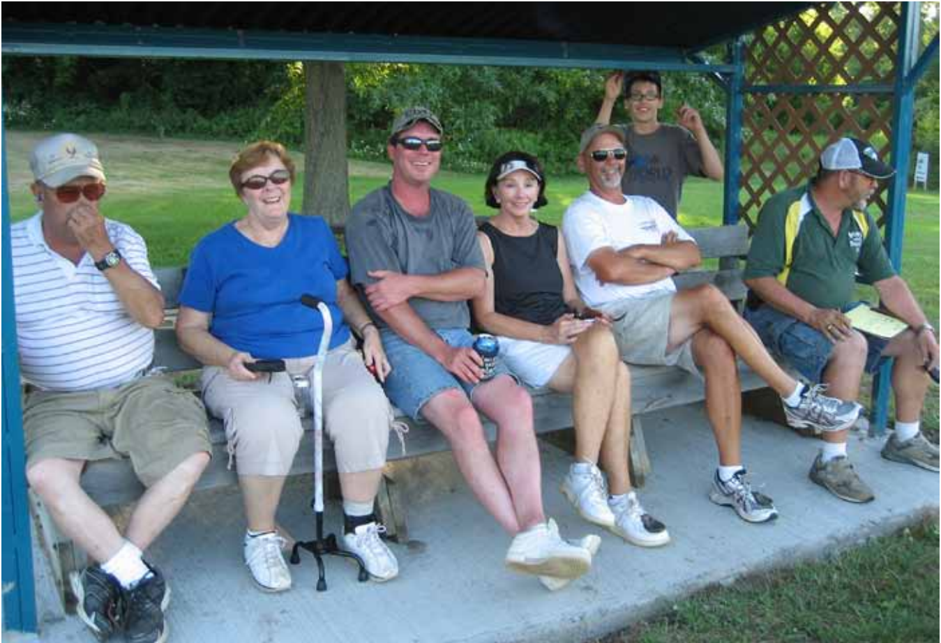
The Crowd was having fun!