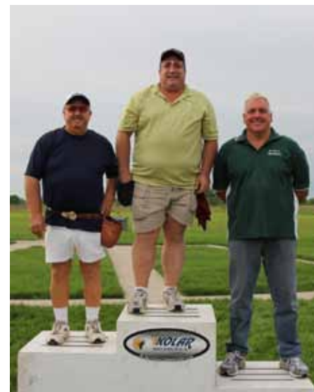
Kolar Mid-America 28-Gauge winners