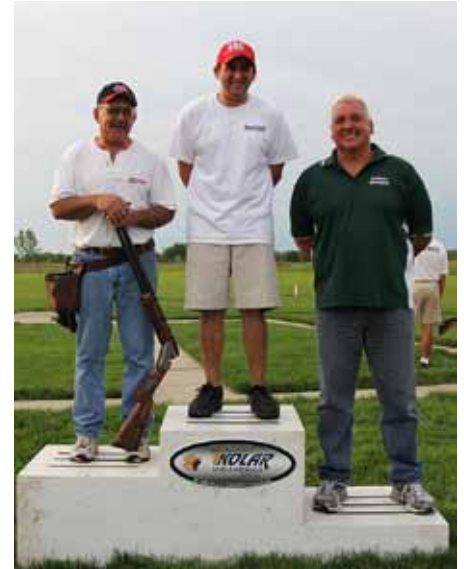
Kolar Mid-America 28-Gauge winners

No matter when the .410 event is held the Wind God usually seems to know, but some how