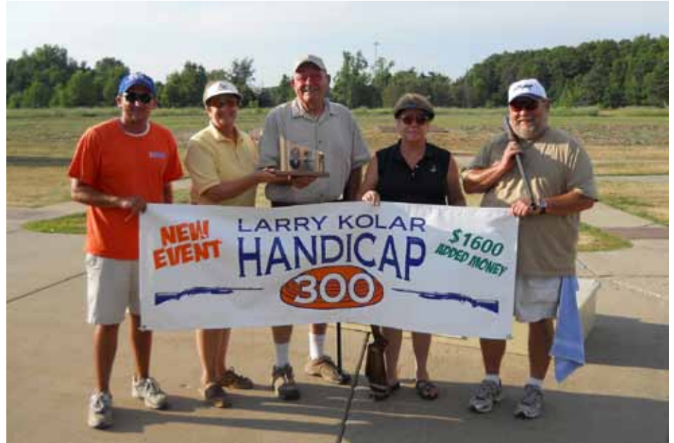
Motor State Kolar Winners.