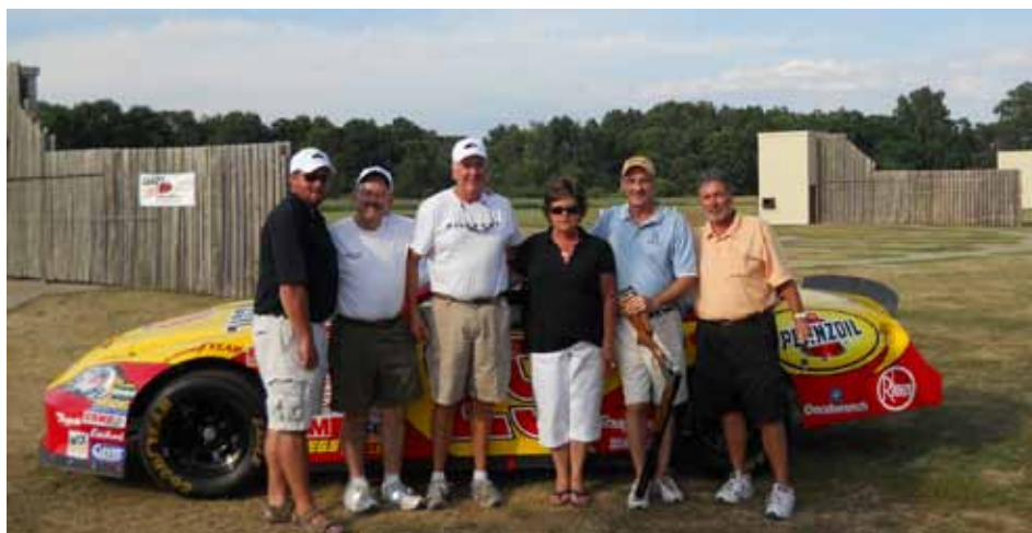
Motor State 410