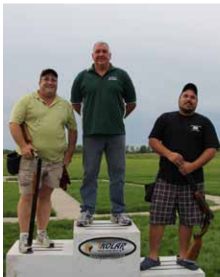
Kolar Mid-America .410 Bore winners