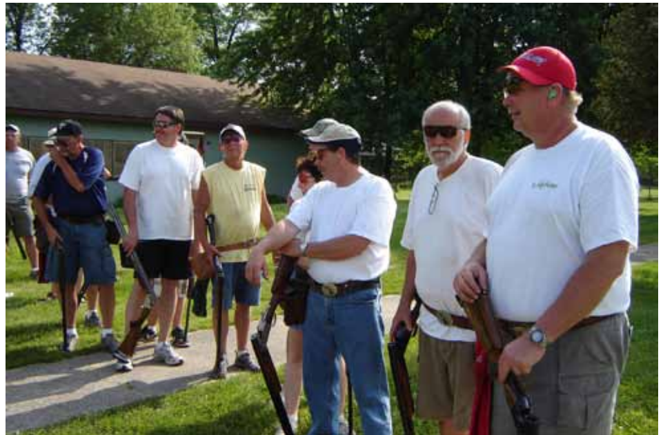
Shooters line up for the Briley HOA Handicap Event.