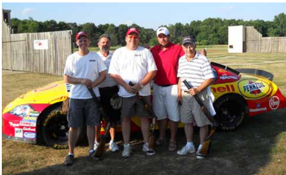
Motor State 28 Gauge